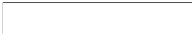
D:\ND-2011-3\es_33439\es_33439_a2_2D.dxf Areal: 0.170 m2